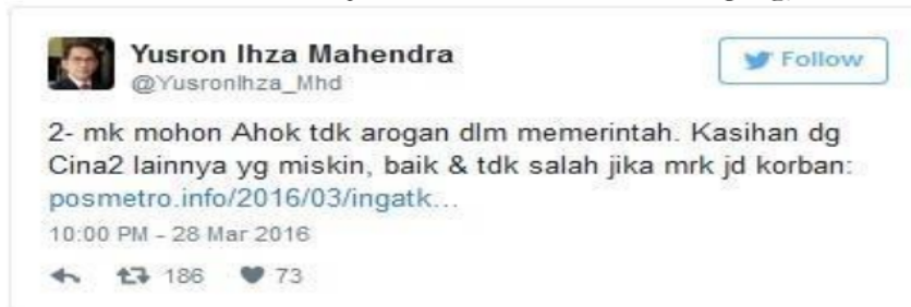
Picture 1.3 Post by Indonesia Ambassador for Jepang, Yusron Ihza Mahendra