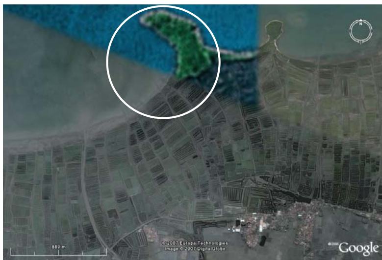
Figure 1. Pulau Dua Nature Reserves, Serang, Banten Province

This research consisted of field research and laboratory research. The field research was conducted in CAPD, Serang (Figure 1).